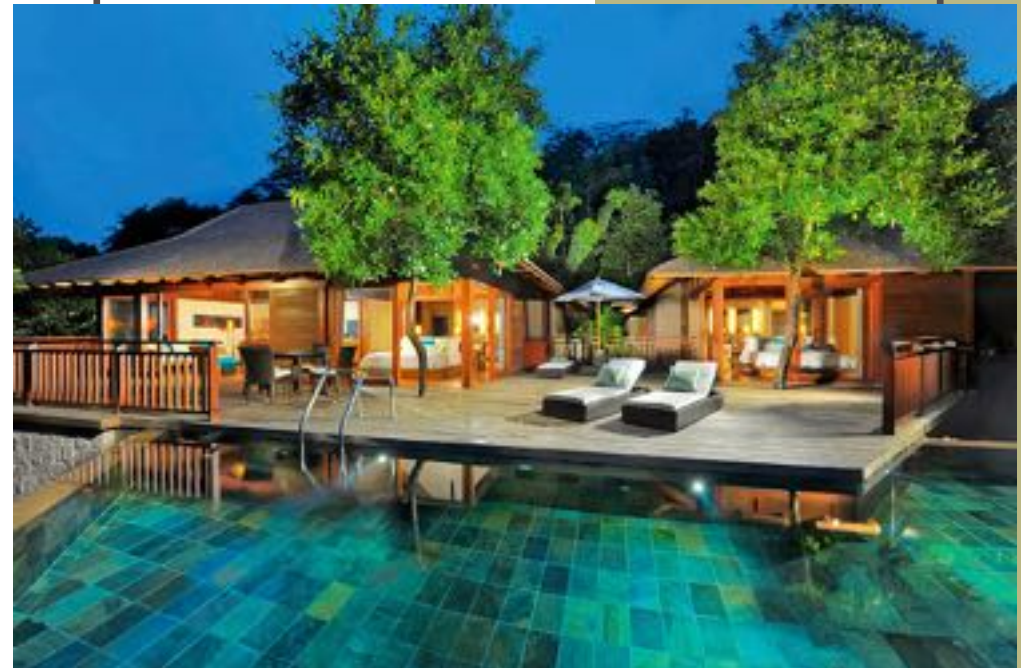
EPELIA RESORT, SEYCHELLES