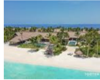
ITHAAFUSHI WALDORF ASTORIA