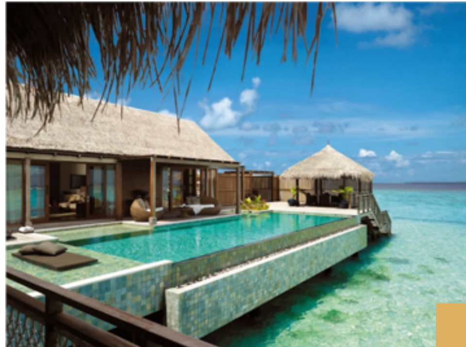
SHANGRI-LA VILLINGILI RESORT & SPA