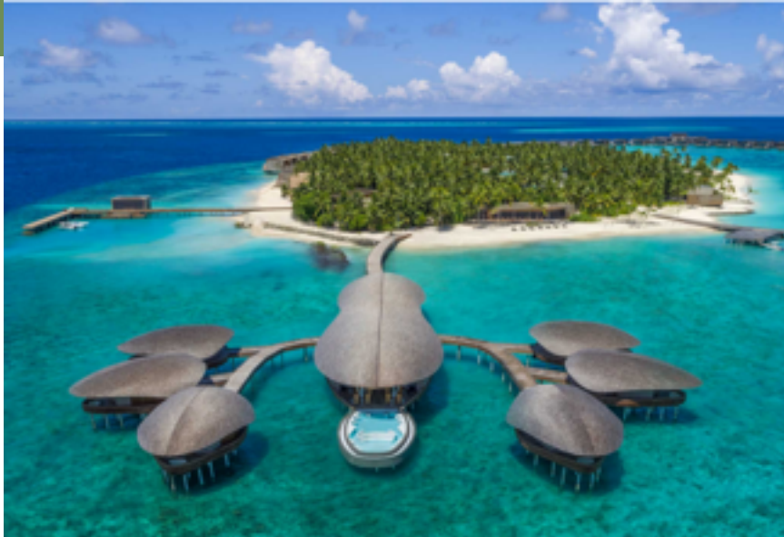
ST.REGIS VOMMULI RESORT, MALDIVES