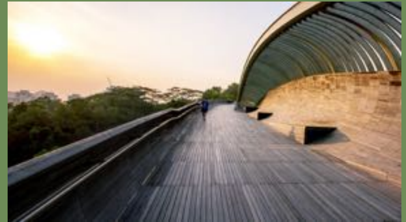
Henderson Wave Bridge Walkway, Singapore.