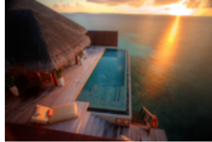
AYADA RESORT, MALDIVES