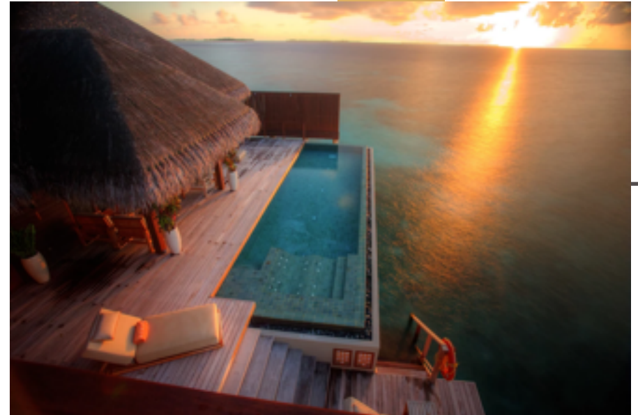
AYADA RESORT, MALDIVES

Borneo Benar's headquarters and manufacturing operations are based in Sabah, Malaysia with marketing and logistics branches in Maldives, Sri Lanka and Holland.