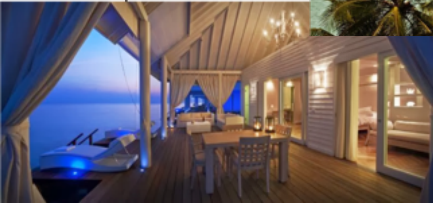
ATHURUGA RESORT, MALDIVES