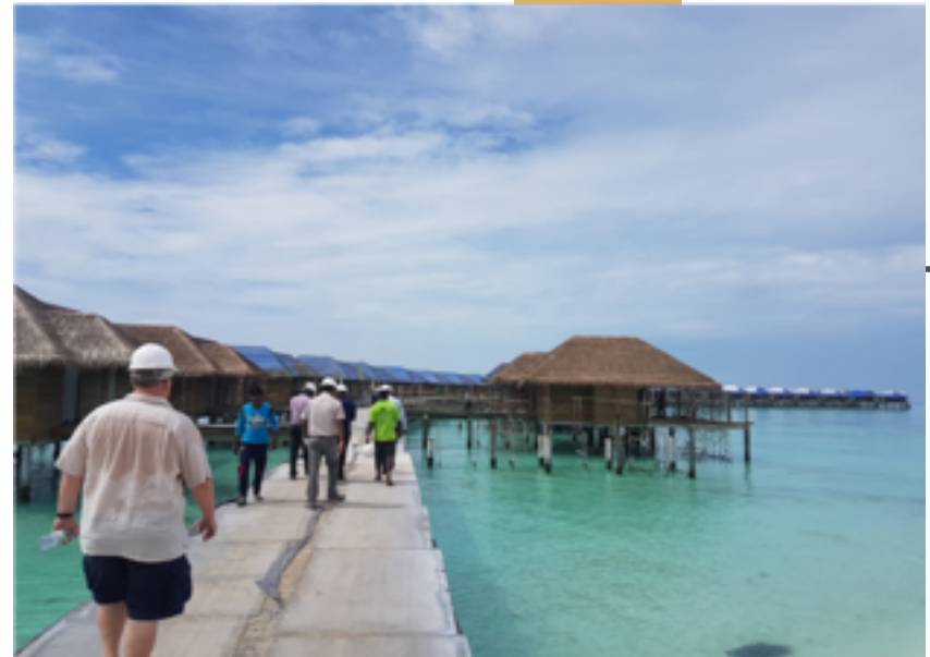
VAKKARU RESORT, MALDIVES

Further site inspection visits by our engineers, consultants and management team are made during construction phase to provide further technical support and to ensure adherence to deadlines and high-quality standards.