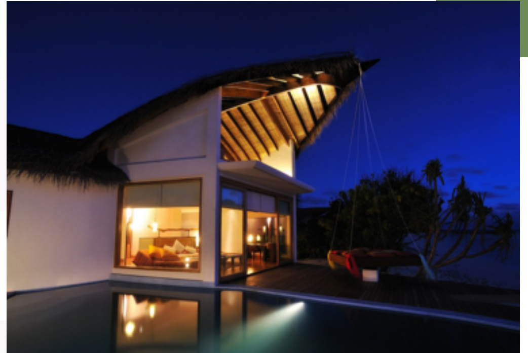
VICEROY RESORT, MALDIVES