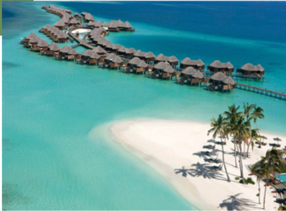
CONSTANCE HALAVELI, MALDIVES